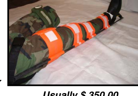
Usually $ 350.00

A Splint to solve your leg traction needs in a small half kilogram bag. Entire splint, and ankle hitch, are designed to fit Adult through Paediatric patients. Integral Reflective Strap System; comes out of the bag ready to go, no loose straps. Requires minimal patient movement with no Perineal nerve impingement. Tested extensively in the field by numerous organisations through numerous areas of the world.